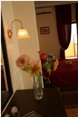
Discreet luxury in all the places..

Real experience ... A relaxing and calm atmosphere.... Discreet luxury in all places, using materials that have been brought from all over the world, in order to achieve the best result. Furniture made from the finest leathers, woollen carpets, buckrams made of wool and pure silk, terracotta Italian tiles and Bohemian crystals are some of the materials that